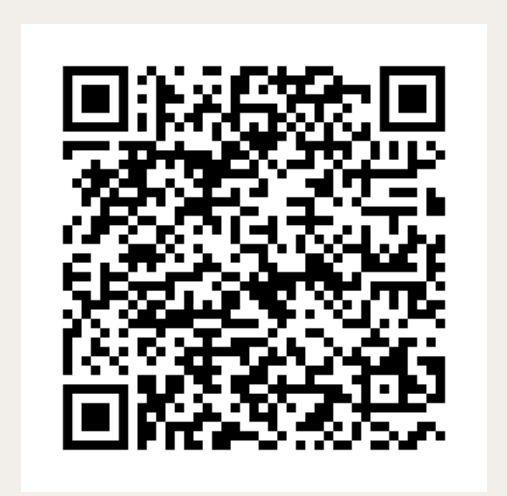
Scan to read our Playbook